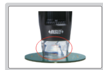
focus supporting ring