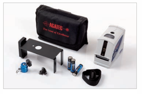
INCLUDES Laser, multi use mount, swivel mount, pouch, 3 x AA batteries