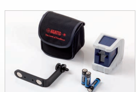
INCLUDES Laser, pouch, 3 x AA batteries